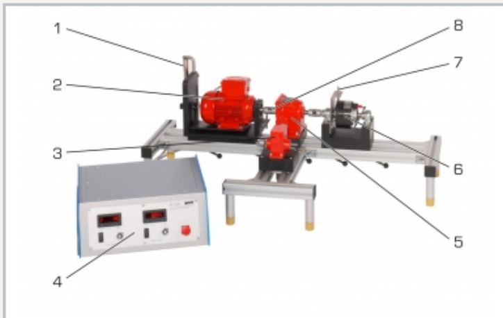
1 spring balance, 2 motor, 3 worm gear, 4 display and control unit, 5 spur gear, 6 brake, 7 brake lever arm, 8 coupling