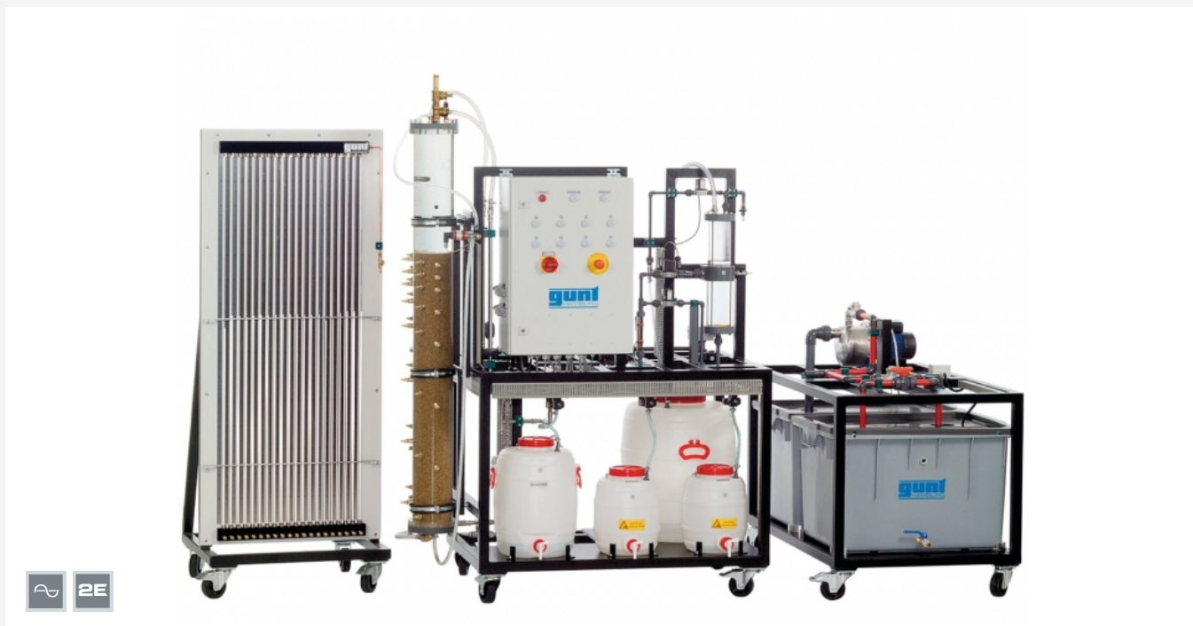
The illustration shows from left to right: manometer panel, trainer, supply unit.