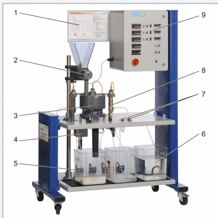
1 process schematic, 2 spiral conveyor for extraction material, 3 revolving extractor, 4 revolving extractor drive unit, 5 pump (behind the tanks), 6 tank, 7 mode selector valves, 8 heater and solvent feed, 9 switch cabinet with controls