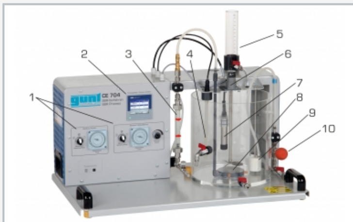
1 control elements for the compressor and for the stirring machine, 2 process controller, 3 flow meter (air), 4 pH value sensor, 5 metering device, 6 stirring machine, 7 oxygen sensor, 8 aeration device, 9 float for clear water extraction, 10 suction bulb for clear water