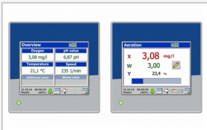
Digital process controller display of process variables (left), user interface for controlling oxygen concentration (right)