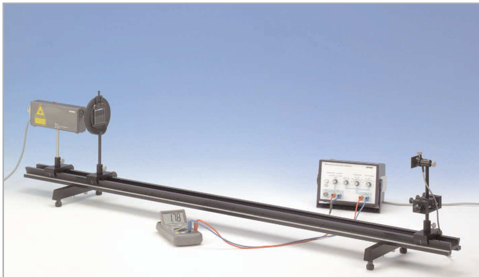
Fig 1: Experimental set-up for the investigation of the diffraction intensity of slit and strip. (The positions of the slide mounts and of the components on the optical bench are: laser and measurement slide mount each at an end of the bench; object holder = 19 cm).

An aperture consisting of a single slit and a complementary strip (wire) is illuminated with a laser beam. The corresponding diffraction patterns are measured according to position and intensity with a photocell which can be shifted.