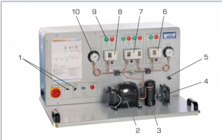
1 controls, 2 compressor, 3 receiver, 4 fan, 5 vent valve, 6 high pressure pressure switch, 7 combined pressure switch, 8 low pressure pressure switch, 9 signal lamps for switching state, 10 manometer