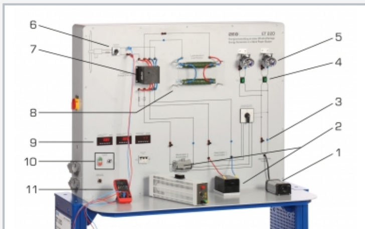
1 inverter, 2 accumulators, 3 current and voltage measuring point, 4 switch for electrical load, 5 bulbs as consumers, 6 wind power plant brake switch, 7 charge controller, 8 load resistances, 9 displays for wind velocities and speed, 10 control elements for axial fan, 11 multimeter