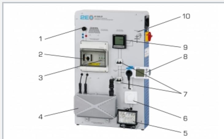
1 connector for photovoltaic modules, 2 DC switch-disconnector, 3 over voltage protection, 4 inverter, 5 halogen lamp, 6 dimmer, 7 fuses, 8 energy meter own consumption, 9 two way energy meter grid, 10 grid connection