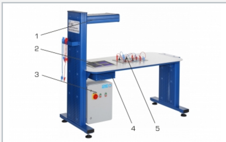
1 lighting unit, 2 four monocrystalline Si solar cells, 3 control unit, 4 Peltier module, 5 patch panel