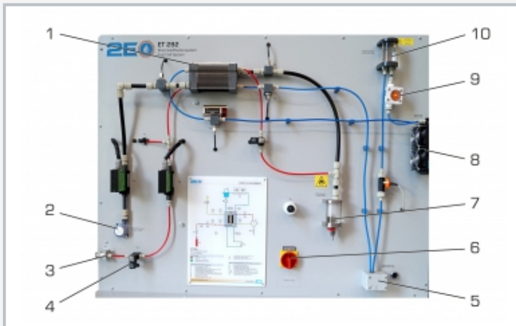
1 fuel cell, 2 cathode blower, 3 low-pressure reducing valve, 4 inlet valve, 5 cooling water pump 6 main switch, 7 water separator, 8 water cooler, 9 visual flow indicator, 10 cooling water tank