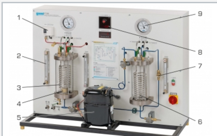
1 pressure switch, 2 flow meter, 3 condenser, 4 expansion valve, 5 compressor, 6 evaporator, 7 sight glass, 8 temperature display, 9 manometer