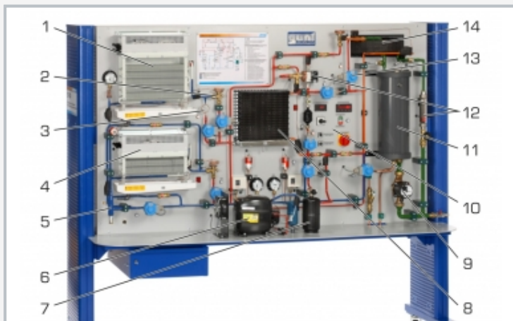
1 evaporator, 2 expansion valve, 3 capillary tube, 4 freezing stage evaporator, 5 evaporation pressure controller, 6 compressor, 7 receiver, 8 heat exchanger with fan, 9 pump, 10 display and control elements, 11 tank for glycol-water mixture, 12 flow meter, 13 solenoid valve, 14 coaxial coil heat exchanger