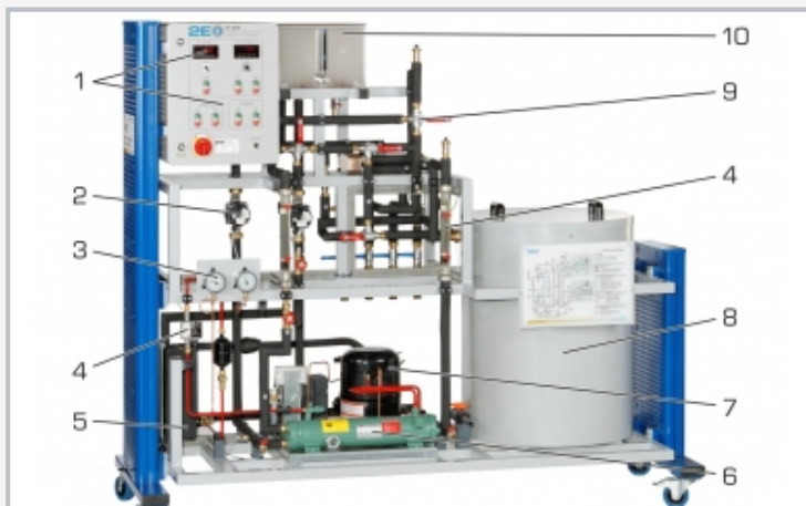
1 displays and controls, 2 pump, 3 manometer, 4 flow meter, 5 evaporator, 6 condenser, 7 compressor, 8 ice store, 9 3-way valve, 10 compensation tank (glycol-water mixture)