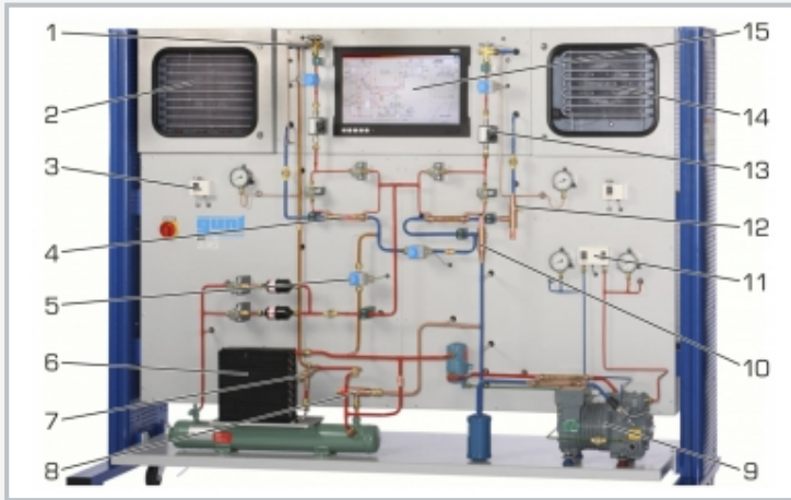
1 expansion valve, 2 freezing chamber, 3 thermostat, 4 heat exchanger, 5 solenoid valve, 6 condenser, 7 condensation pressure controller, 8 capacity controller, 9 compressor, 10 start-up controller, 11 pressure switch, 12 evaporation pressure controller, 13 flow meter, 14 refrigeration chamber, 15 touch panel PC