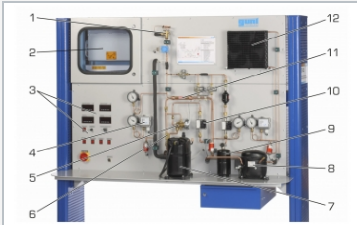
1 expansion valve, 2 refrigeration chamber, 3 displays and controls, 4 pressure switch, 5 injection valve, 6 injection cooler, 7 LP compressor, 8 HP compressor, 9 receiver, 10 flow meter, 11 heat exchanger, 12 condenser