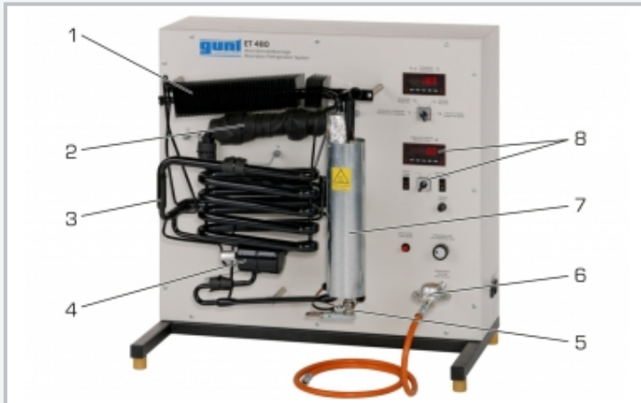
1 condenser, 2 evaporator with heater, 3 absorber, 4 tank, 5 gas burner, 6 pressure reducing valve for propane gas operation, 7 boiler with bubble pump to separate the ammonia, 8 displays and controls