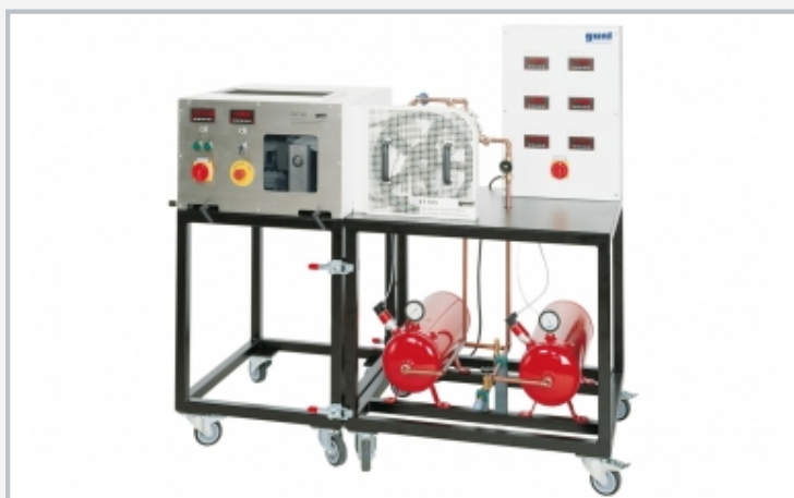
The illustration shows a complete experimental setup with ET 513 and HM 365