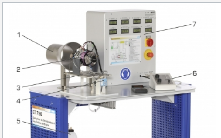
1 mixing pipe, 2 jet engine, 3 turbine platform, 4 force sensor for thrust measurement, 5 fuel tank, 6 gas turbine controls, 7 switch cabinet