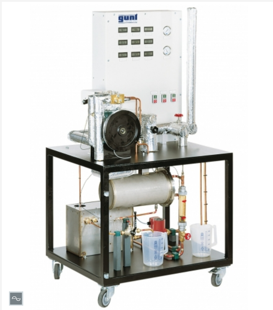
The illustration shows a similar unit.