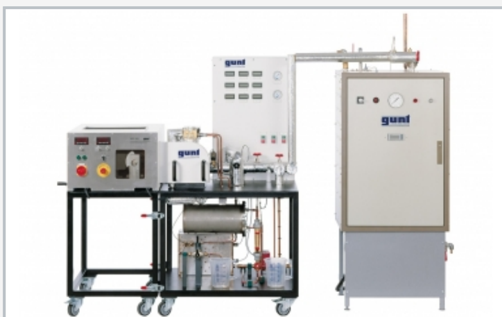
Experimental setup ready for operation: left: brake unit HM 365, centre: two-cylinder steam engine ET 813, right: steam generator ET 813.01