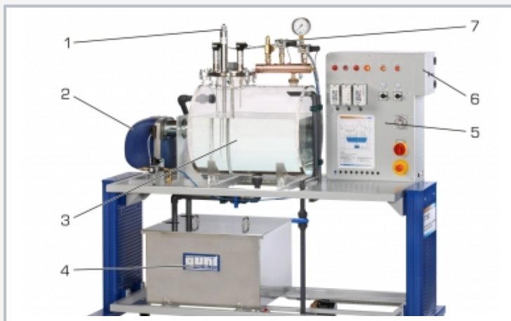
1 water level monitoring, 2 burner, 3 steam boiler model, 4 supply tank, 5 switch cabinet, 6 switch box for fault circuit, 7 pressure measurement equipment