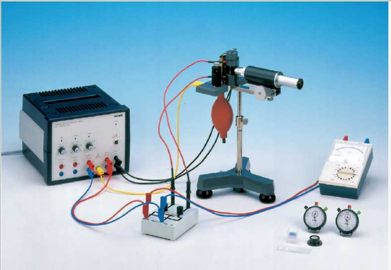
Fig. 1: Experimental set up for determining the elementary charge with the Millikan apparatus.