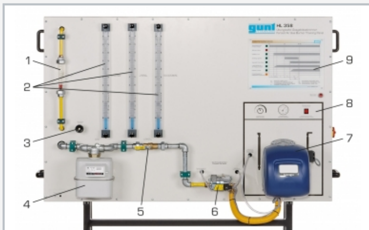
1 flow meter, 2 manometer, 3 valve for gas quantity, 4 gas meter, 5 ball valve, 6 compact fitting, 7 burner, 8 control elements for heating, 9 burner control sequence