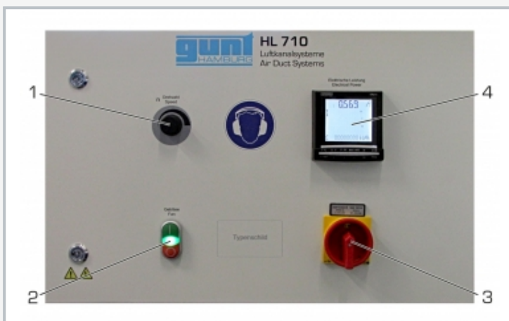
1 fan speed adjustment, 2 fan on/off switch, 3 main switch, 4 power meter