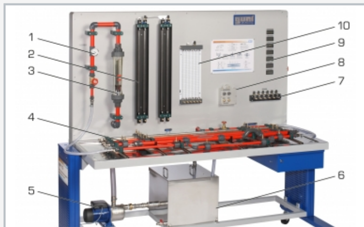
1 thermometer, 2 twin tube manometer, 3 rotameter, 4 different pipe sections, 5 pump, 6 storage tank, 7 pressure sensor, 8 differential pressure meter, 9 digital pressure indicators, 10 6 tube manometers