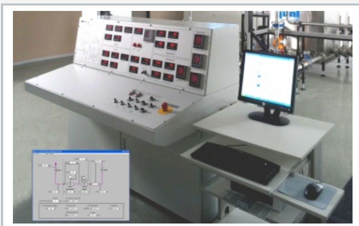
Control station consisting of control console and data acquisition for convenient recording and analysis of the experiments