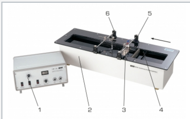
1 display and control unit, 2 water channel with LED illumination along the experimental section, 3 anode, 4 flow straightener, 5 mount for cathode, 6 mount for model; arrow shows the direction of flow