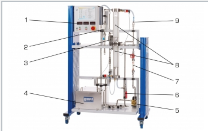
1 digital pressure indicators, 2 air flow meter, 3 compressor for air, 4 storage tank, 5 pump for water, 6 bottom rising-falling switch valve, 7 water flow meter, 8 two-piece packed column, 9 top rising-falling switch valve