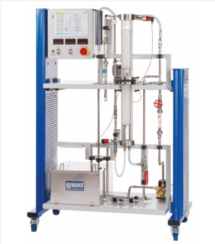
The illustration shows a similar unit.