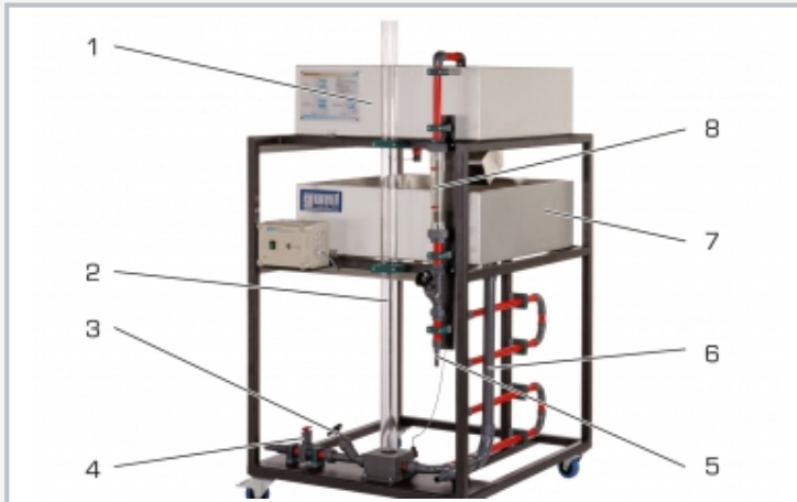
1 basin A with adjustable weir, 2 surge chamber, 3 valve in drain pipe, 4 gate for generating water hammer, 5 water connection, 6 overflow pipe, 7 basin B with overflow, 8 flow meter