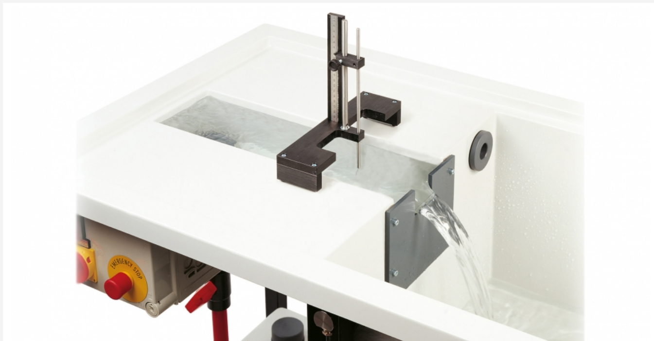
The illustration shows a Rehbock weir incorporated into the HM 150 base module.