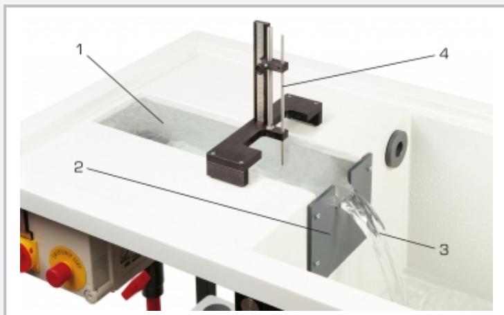
1 experimental flume from HM 150, 2 Rehbock weir, 3 nappe, 4 level gauge