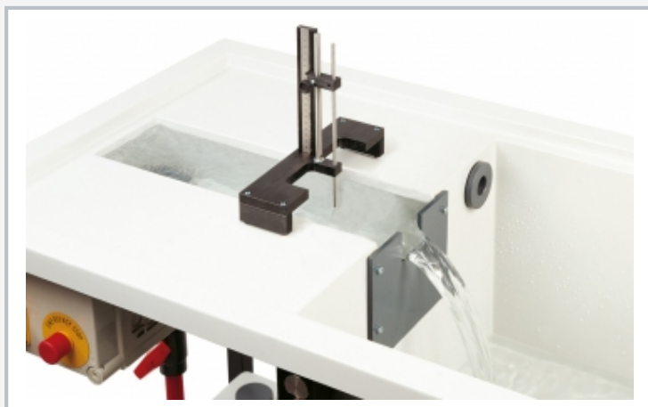
Base module for experiments in fluid mechanics with plate weir HM 150.03