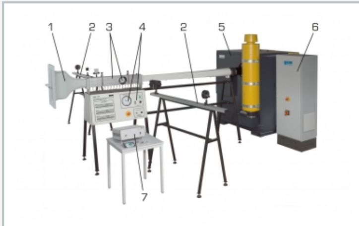
1 supersonic wind tunnel, air inlet, 2 Schlieren optics (two piece), 3 measuring section with two sight windows, 4 control panel with manometer, 5 fan, 6 switch cabinet, 7 data acquisition for pressure