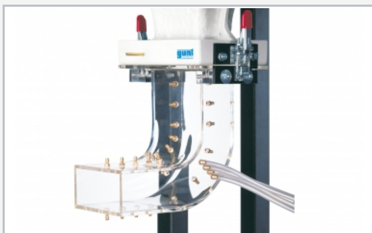
Investigation of flow in a pipe elbow with the accessory HM 225.05