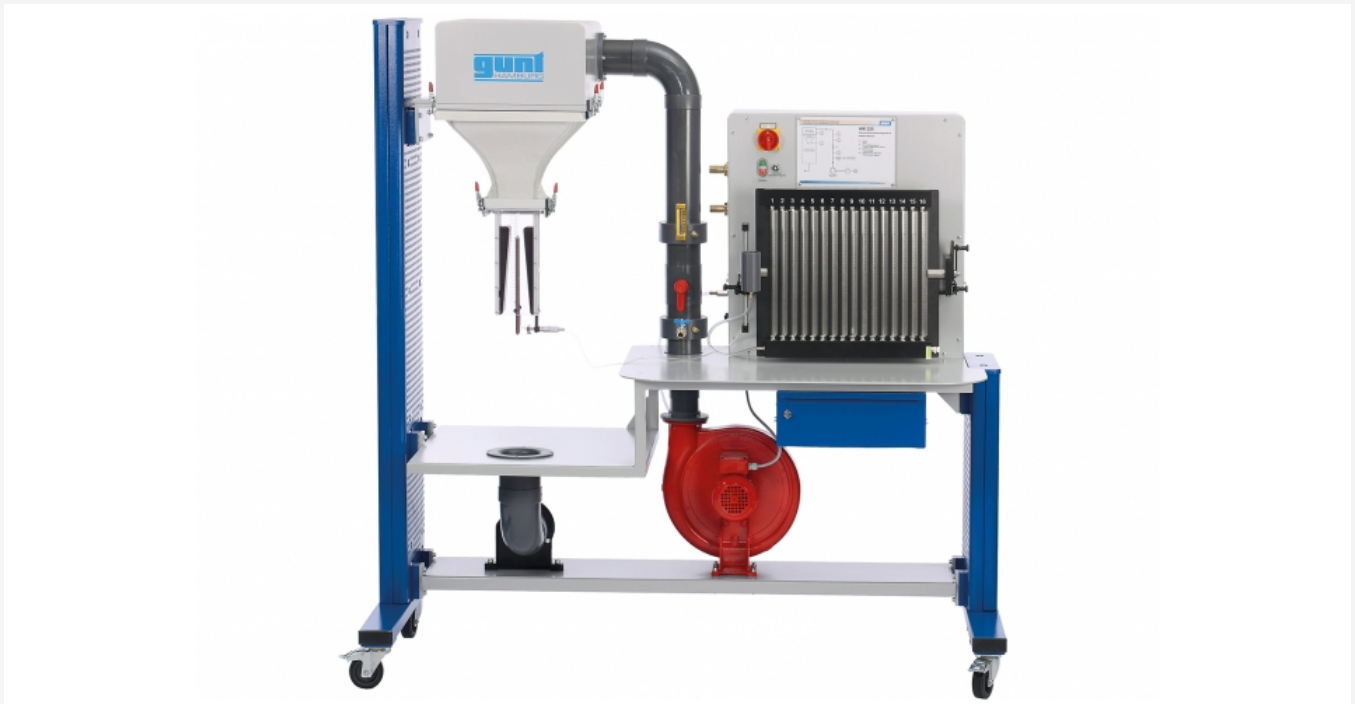
The illustration shows HM 225 together with HM 225.02.