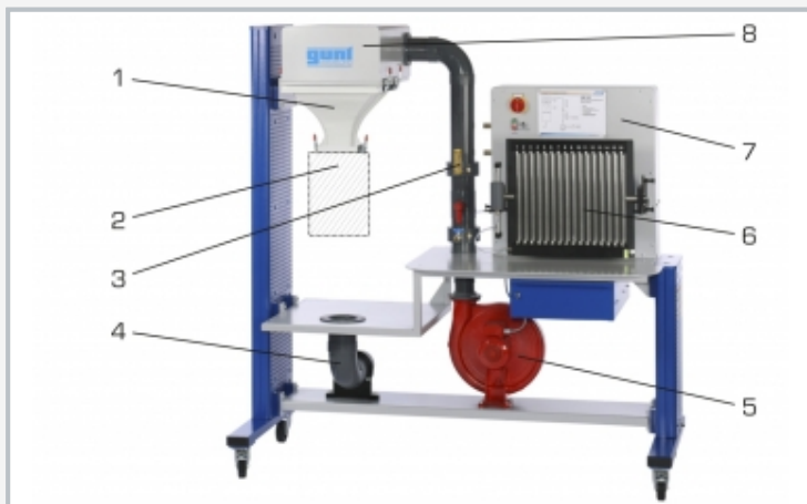
1 nozzle, 2 installation measuring section, 3 thermometer, 4 exhaust air pipe, 5 radial fan, 6 tube manometers, 7 switch cabinet with speed adjustment, 8 stabilisation tank with flow straightener