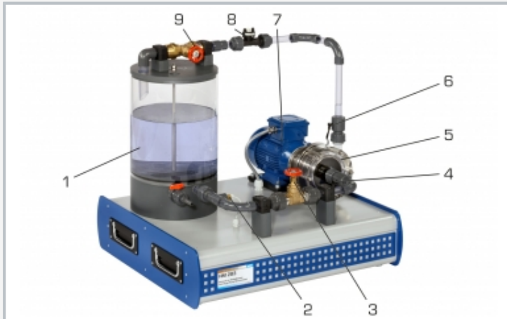
1 water tank, 2 temperature sensor, 3 valve at inlet, 4 pressure sensor at inlet, 5 pump, 6 pressure sensor at outlet, 7 motor, 8 flow meter, 9 valve at outlet