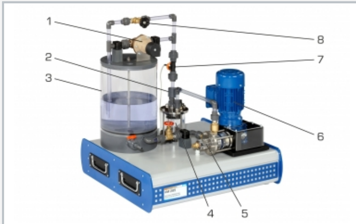
1 overflow valve, 2 pressure sensor at outlet, 3 water tank, 4 air vessel, 5 piston pump, 6 motor, 7 flow meter, 8 needle valve for adjusting the flow rate