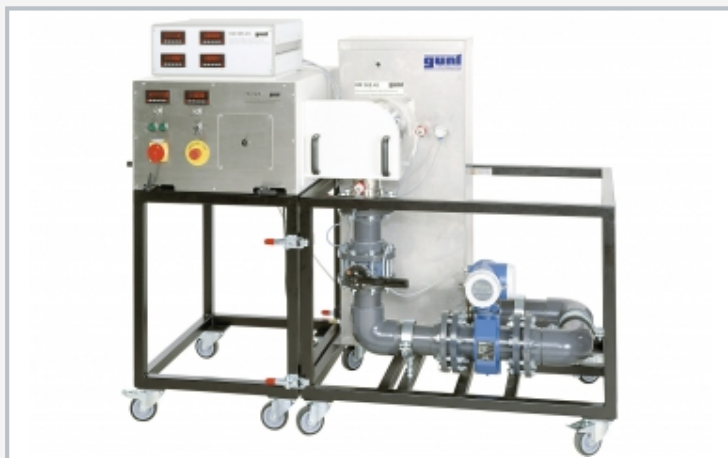
Example of a complete experimental setup: HM 365.45 axial-flow pump, connected to HM 365 universal drive and brake unit

Representation of 4-quadrant operation in speed/torque diagram: I motor operation, clockwise rotation (drive), II generator operation, anticlockwise rotation (brake), III motor operation, anticlockwise rotation (drive), IV generator operation, clockwise rotation (brake); red line: energy flow, M torque, n speed