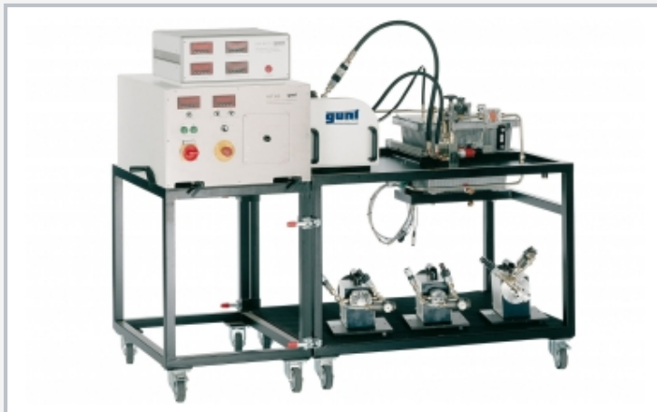
Functional experimental setup: drive unit HM 365 (left), HM 365.20 with pump under investigation (right)