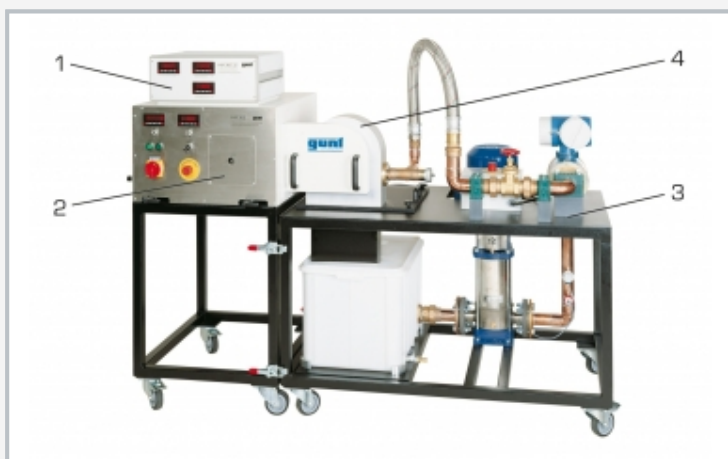
1 measuring amplifier with digital display of measured values, 2 HM 365 Universal Drive and Brake Unit, 3 HM 365.32, 4 HM 365.31 Pelton and Francis Turbine