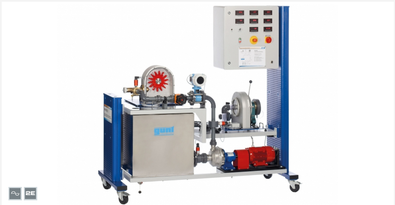
The illustration shows HM 450C together with the two turbines HM 450.01 (left) and HM 450.02 (right).