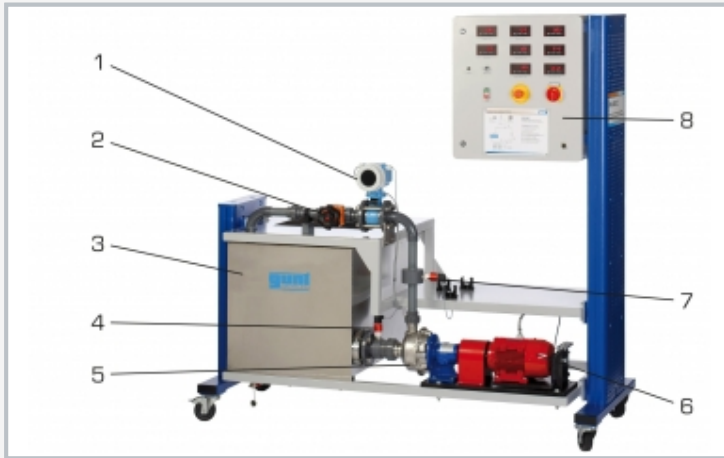
1 electromagnetic flow meter, 2 flow control valve, 3 storage tank, 4 pressure sensor at pump inlet, 5 centrifugal pump, 6 drive motor including measurement of torque, 7 pressure sensor at pump outlet, 8 switch cabinet with displays and controls