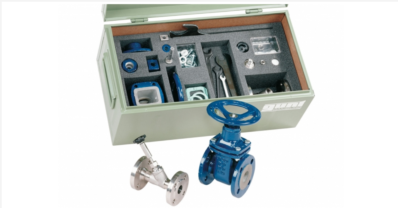
The illustration shows the tool box with parts sets and tools. In the foreground the valves and fittings as they are assembled from the parts sets.