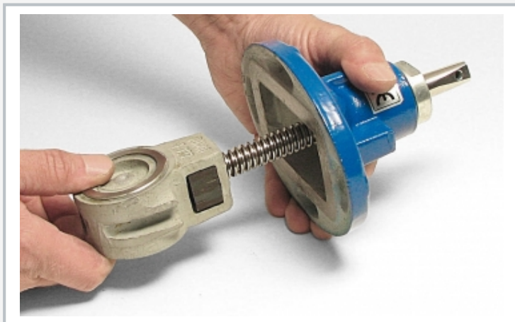
Assembly of the slider