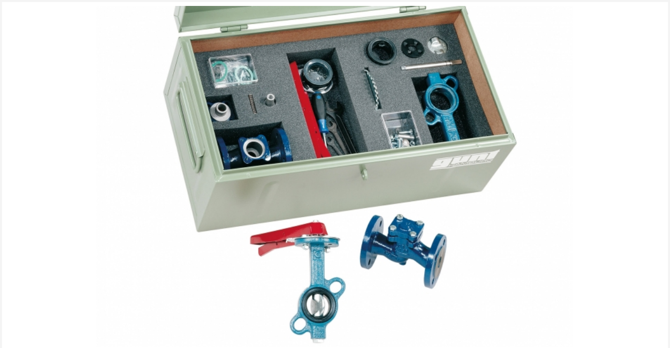
The illustration shows the tool box with parts sets and tools. In the foreground the valves and fittings as they are assembled from the parts sets.