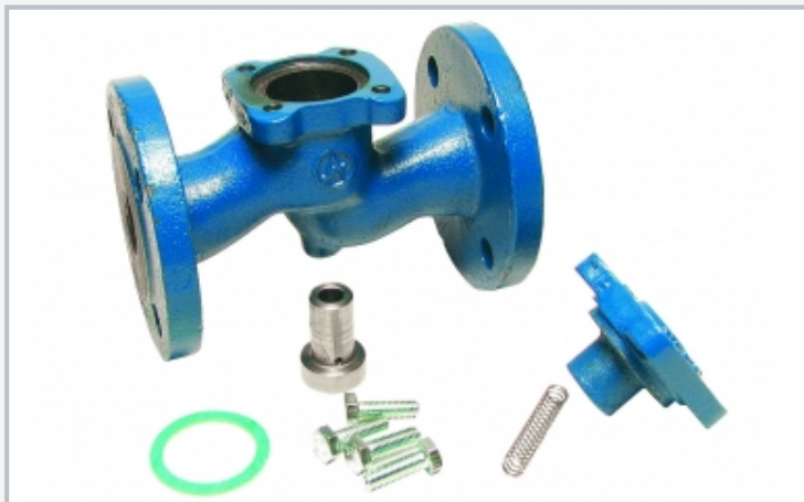
Non-return valve, disassembled