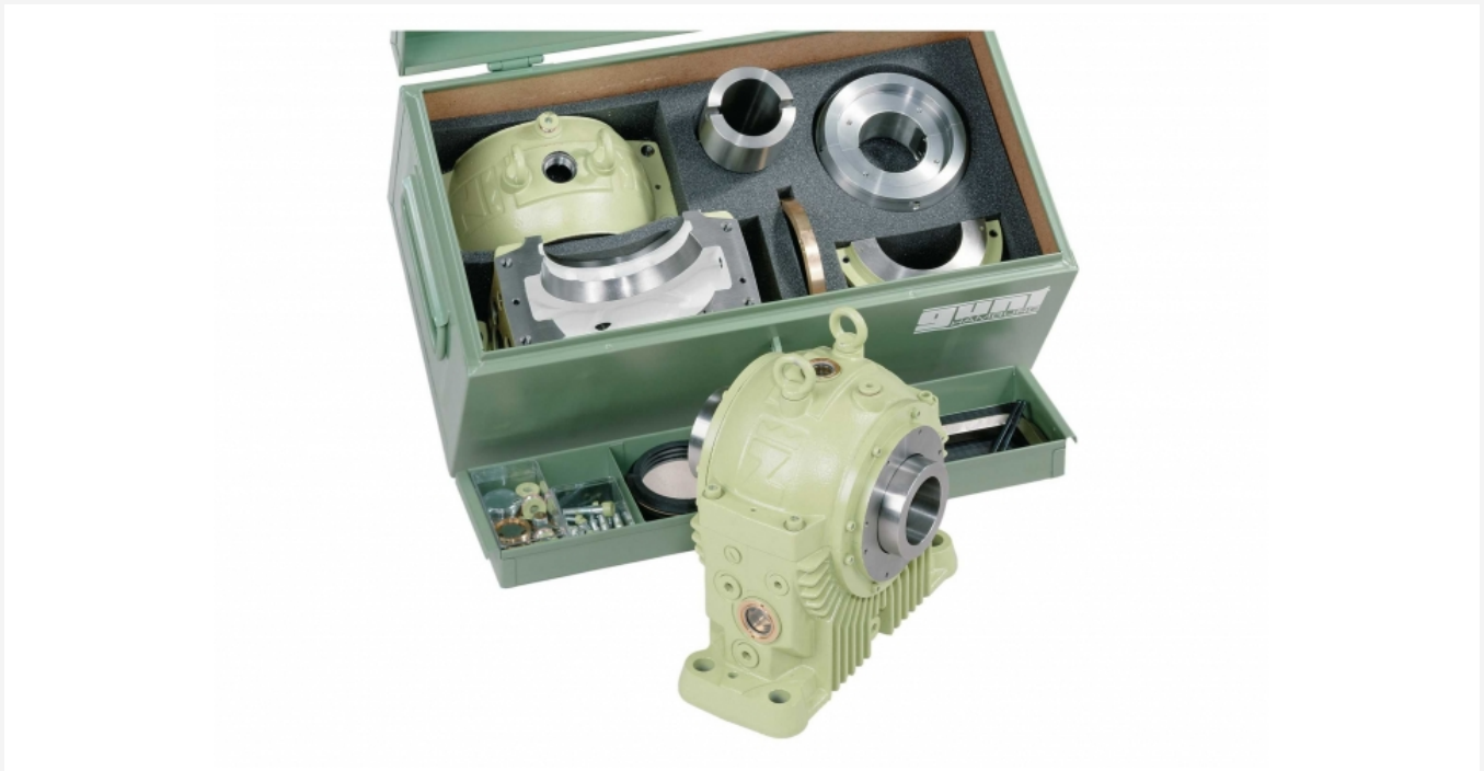
The illustration shows the tool box with assembly kit and parts compartment insert. A fully assembled journal bearing is shown in the foreground.