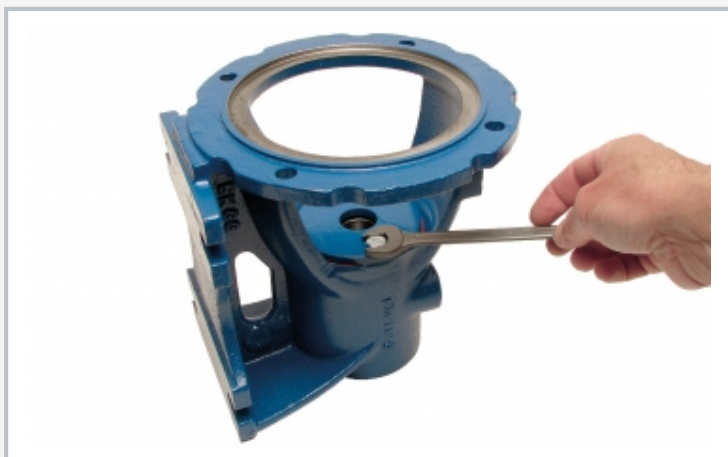
Assembly of the centrifugal pump: fixing of the bearing cover with screws