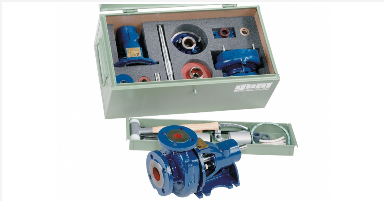
The illustration shows the tool box with kit and tool inlay, and in the foreground the fully assembled pump.