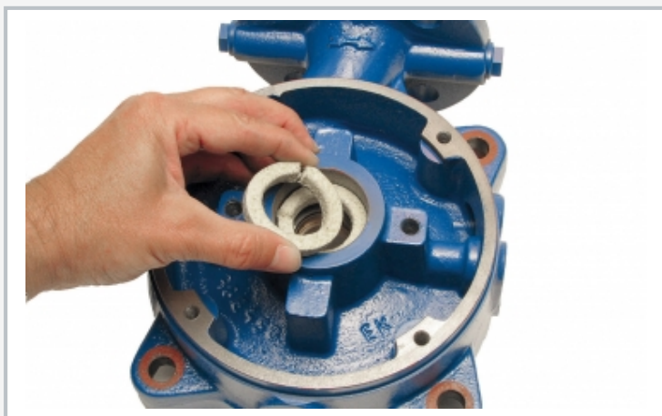
Assembly of the four-stage centrifugal pump: assembling the packing gland rings