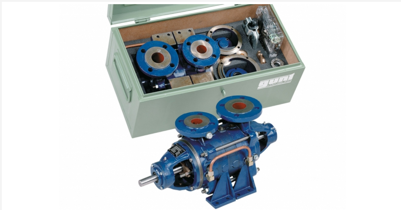
The illustration shows the tool box with kit and tools. The fully assembled pump is shown in the foreground.