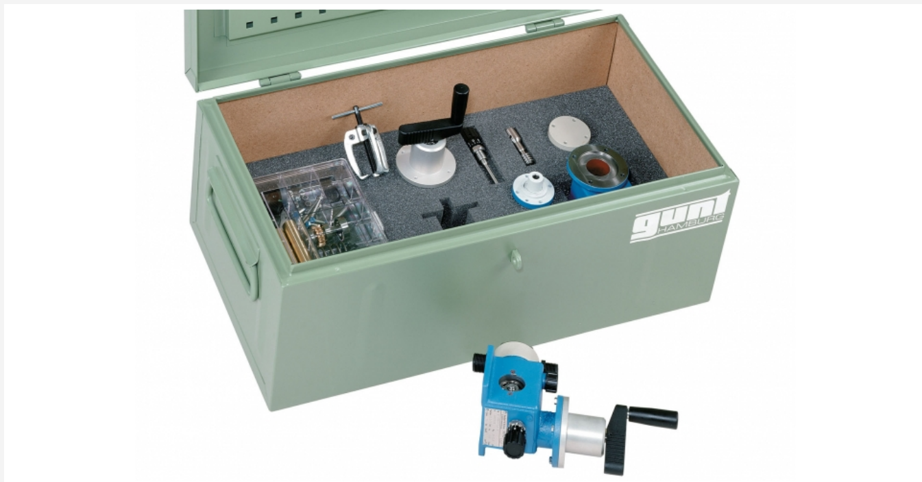
The illustration shows the tool box with kit and tools. The fully assembled pump is shown in the foreground.