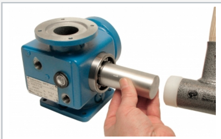
Assembly of the diaphragm pump: driving the eccentric into the housing (using a device)