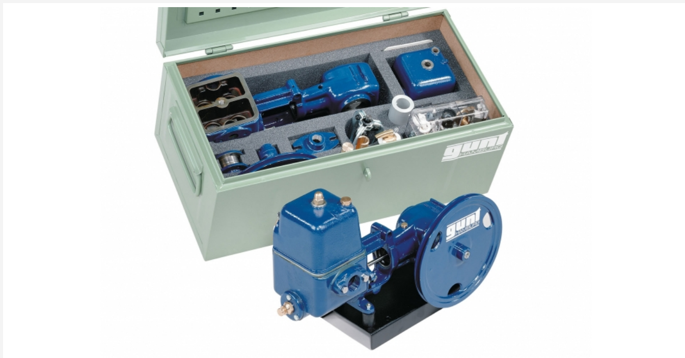
The illustration shows the tool box with kit and tools. The fully assembled pump is shown in the foreground.