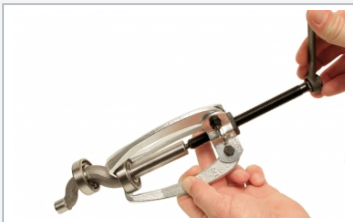
Dissassembly of the piston pump: pulling off the ball bearing of the eccentric shaft (using a bearing puller)