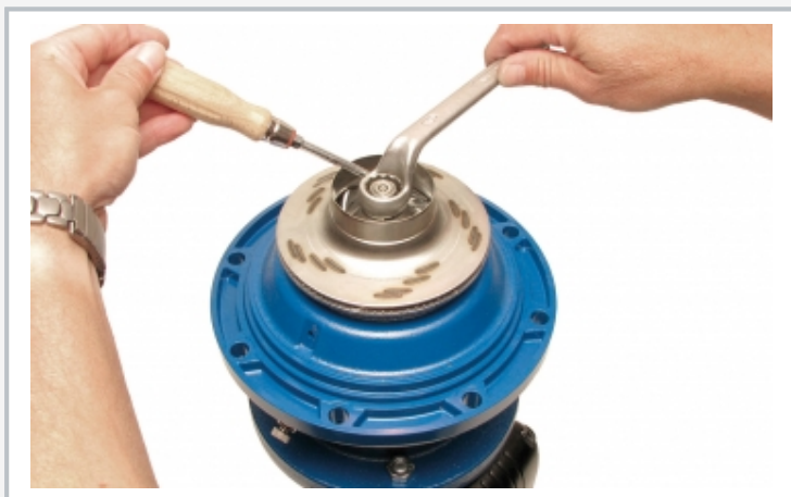
Assembly of the in-line centrifugal pump: tightening the impeller nut