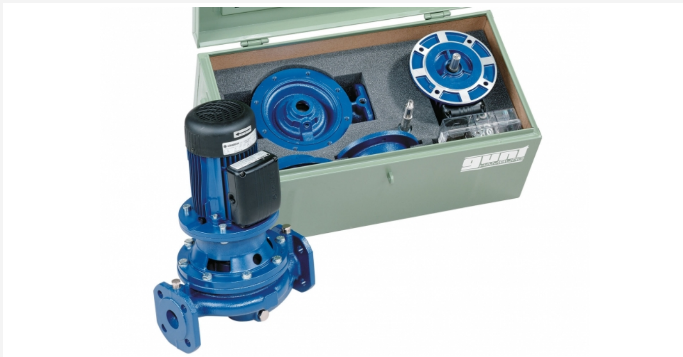
The illustration shows the tool box with kit and tools. The fully assembled pump is shown in the foreground.