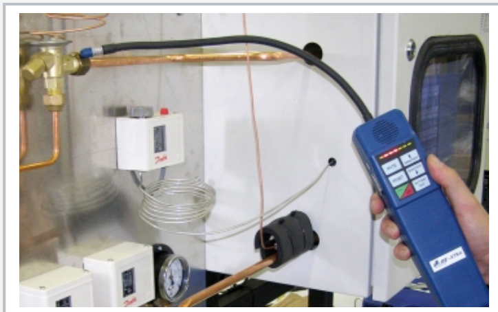
Leak test at the expansion valve of the fully assembled system