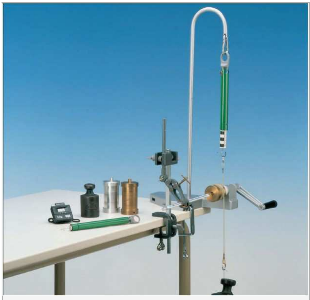
Fig. 1: Experimental set-up: Mechanical equivalent of heat.