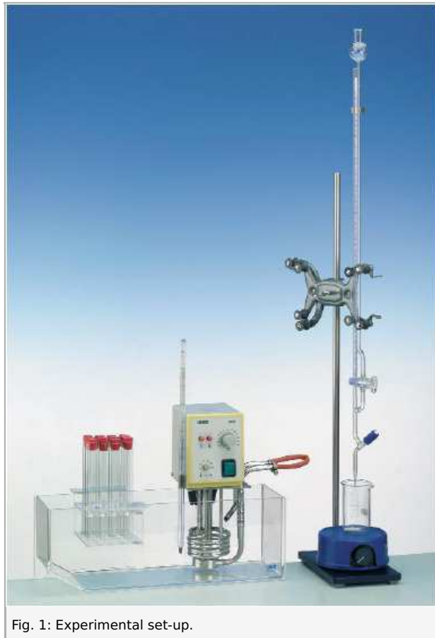
Fig. 1: Experimental set-up.