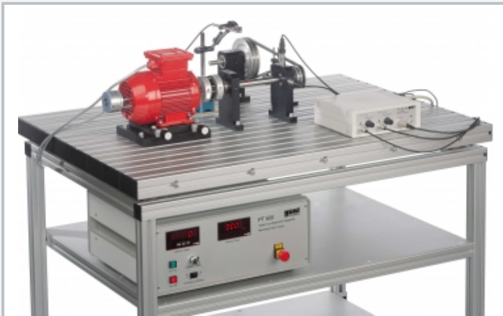
The illustration shows PT 500.12 together with PT 500, PT 500.01, PT 500.14 and PT 500.04.